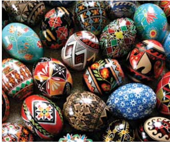
Decorated eggs have pagan roots and Christian meaning.

ity a thousand years ago the egg was adapted as a Christian symbol. An egg is eaten first to break the fast of Lent. ("Fast" in this context doesn't mean starvation, just the avoidance of rich foods.) The decorated pysanky were also adapted by being decorated with designs of Christian importance. The pysanky's new symbolism was as a sign