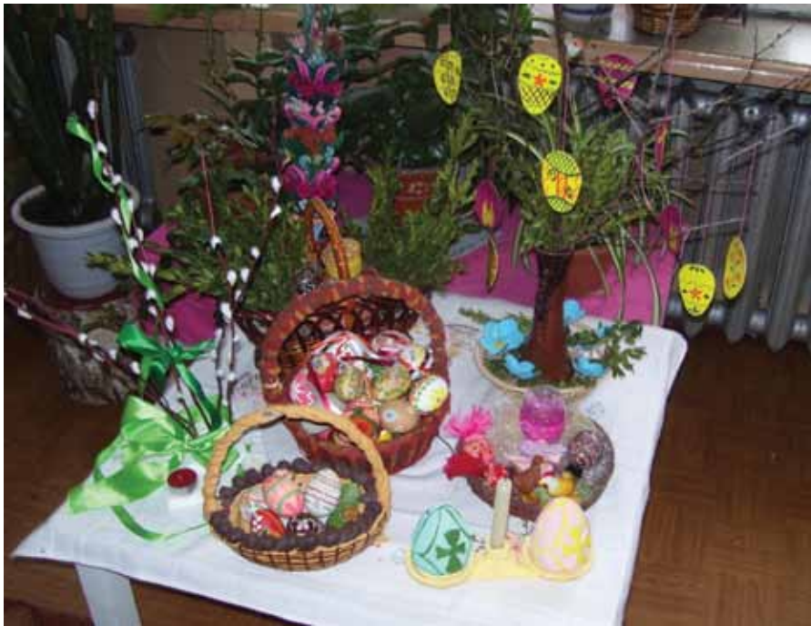
An Easter table is a Ukrainian tradition.

We Christians have a much more dramatic story to tell — a much more unbelievable story — yet we believe it because it is true. God became man. Man was born of a virgin. He lived without sin, but loved sinners instead of condemning them. He allowed sinners to kill him! He did not hate those who killed him, but forgave them! And then, most incredible of all, this God-man, who had died – how can God die? – CAME BACK TO LIFE!