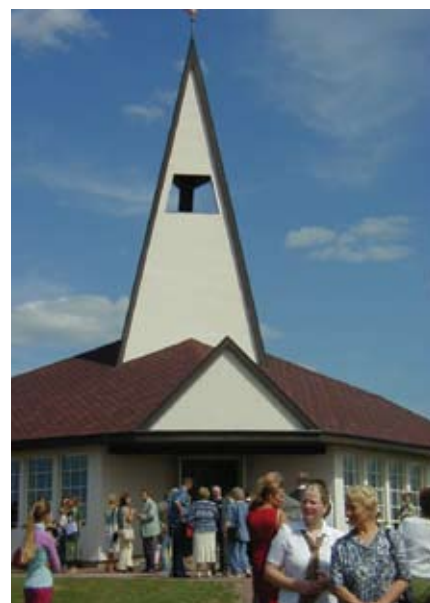
The Confessional Lutheran Church of Latvia comprises seven congregations, including this one at Kekava, a city of 4,600 in central Latvia.

(Editor's Note: Reduced funding from Thoughts of Faith as the U.S. and worldwide economies soured has hit the Confessional Lutheran Church of Latvia particularly hard, especially in its effort to revive the Latvian Lutheran newspaper as its major outreach tool.)