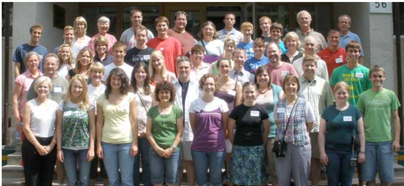
The American volunteers in 2009. In 2010, 35 volunteers are needed in 13 locations

Dates have been set for VBS 2010 in Ukraine from June 30 to July 13. There is need for 35 volunteers in 13 locations. Minimum age is a graduating senior in high school. If you have questions or would like an application, please e-mail Chaplain Moldstad at Don.Moldstad@bhc.edu or Pam Schultz from Thoughts of Faith at pamtof@bhc.edu . Applications are due to Pam by March 30, 2010.