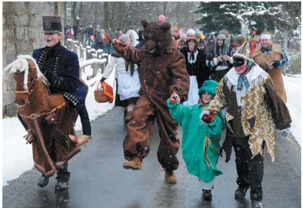
A typical Masopust parade in the Czech Republic includes costumed and masked characters.

Thoughts of Faith is a 501 (c)3 tax exempt organization. All donations are tax deductible to the extent of applicable law. Please check with your tax consultant on your specific situation.