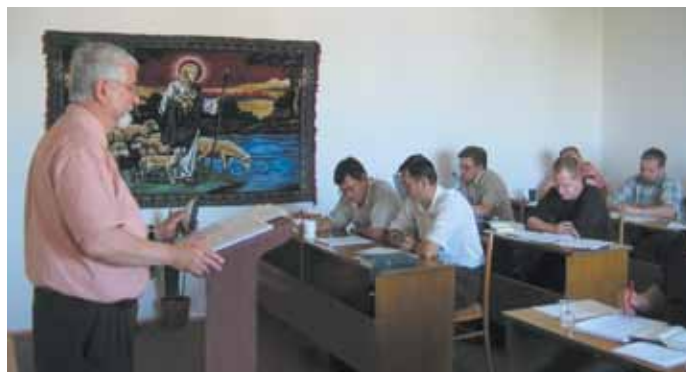
Pastors from throughout Europe attend the summer quarter. To continue in 2010, $5,000 is needed.

Budget limitations have forced the pastors of the ULC to seek secular jobs since their pastoral take-home pay has been reduced to $35 a week. In order to keep the congregations