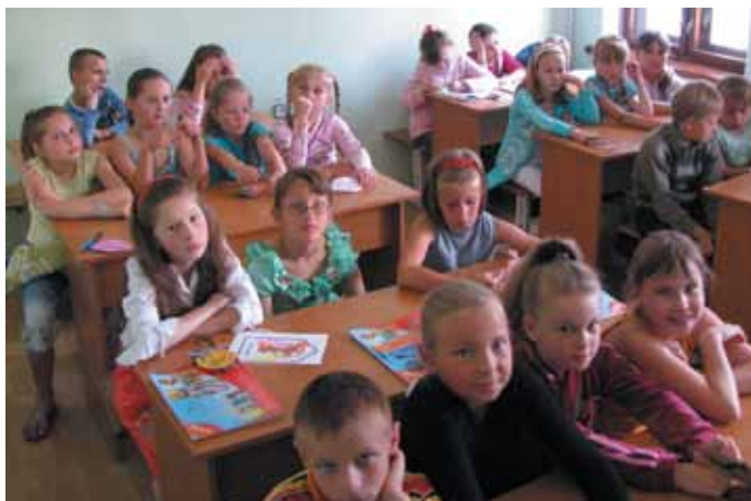
A VBS classroom in Kremenez, Ukraine.

Fourth, you create new friendships with fellow Christians -- among the children you teach and the fellow American