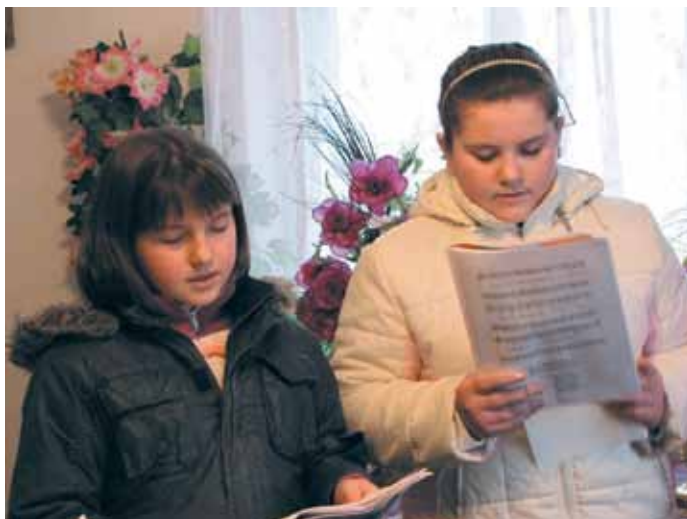
Youngsters stirred the congregation with song.

There has always been one traditional church body in this area, so the appearance of a Lutheran congregation in this small village sprouted interest in some and worry in others. The local Greek Catholic priest warned that this was “his territory” and there was no place for us. Later he used different means to make us go away. We were threatened that the house where we gathered for worship would be burned down. The parents of the children who attended our Sunday school were told to remove their kids immediately or they would be banned from attending their church. On more than one occasion our children and adults had to listen to hurtful remarks and threats from their neighbors. But