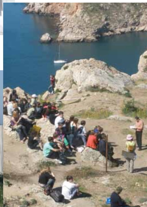
The group studies God's word near the ruins of Chembalo, a 14 th century fortress in Balaklava.