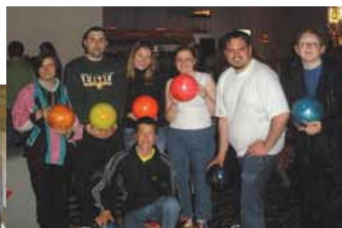
Bowling was one of several activities.