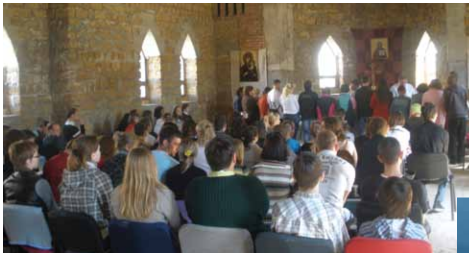
Communion is celebrated in the unfinished church in Sevastopol.