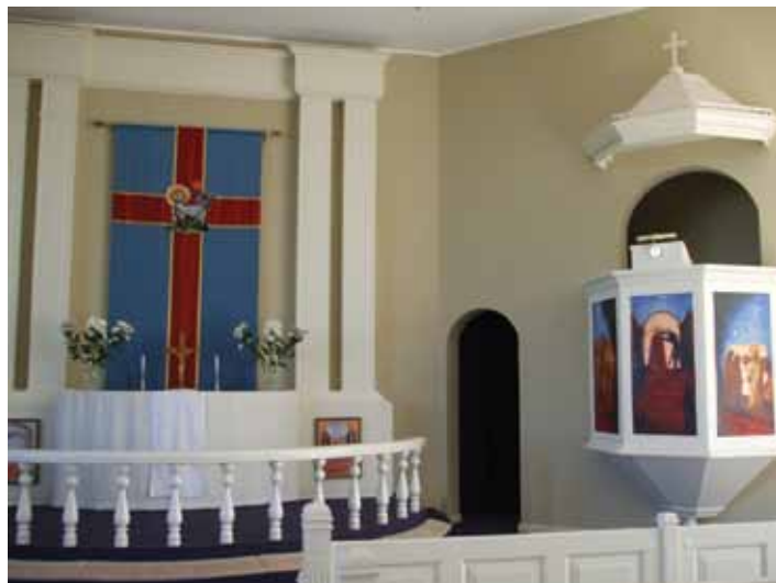
The bright interior of the Kekava church.