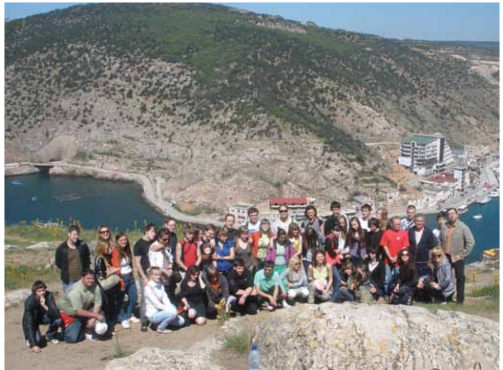
The young people gather on an overlook above an inlet of the Black Sea.

Thoughts of Faith is a 501 (c)3 tax exempt organization. All donations are tax deductible to the extent of applicable law. Please check with your tax consultant on your specific situation.