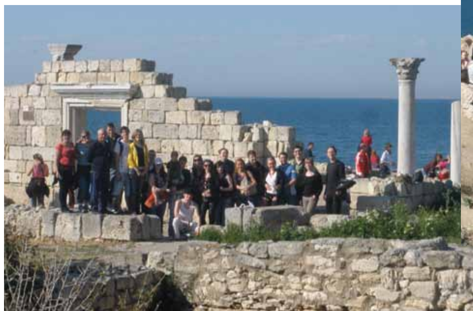
The youth group visited Khersones where tradition says the Apostle Andrew founded a congregation.