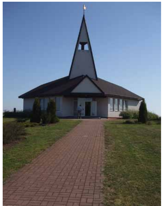
The church building in Kekava is eight years old.