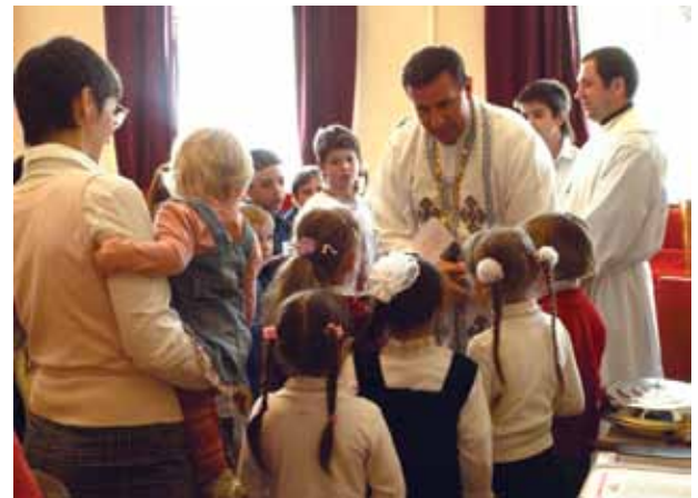
Children of clients of the Kyiv Left Bank Life Center attend services at Resurrection congregation.