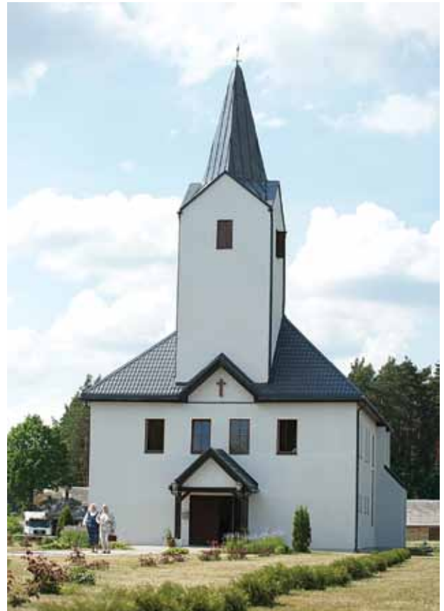
The newly-dedicated church in Ozolniecki, Latvia.

Pentecost always has special meaning for our congregation. It was on Pentecost in 1999 when the Holy Supper was celebrated here the first time. And the most recent Pentecost was special in many ways. It started unusually. Two young boys walked to the altar to give the first "sermons" in their lives. Perhaps the first steps were with timidity. The older is eight years old and younger just six. However, encouraged by Jesus Christ, they moved toward the altar and turned to the members and guests.