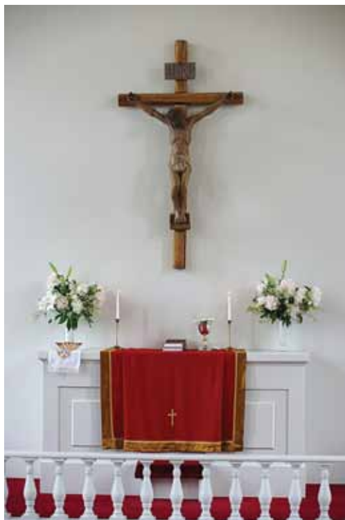
The altar, below which lies the symbolic groundbreaking cornerstone.