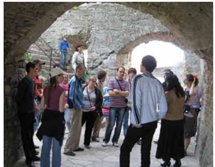
The young people inspect a ruined castle.

The Bible topic for the last day was titled "Blessing." It was prepared by three young men -- two seminary students and a deacon from the Kyiv Resurrection congregation. It